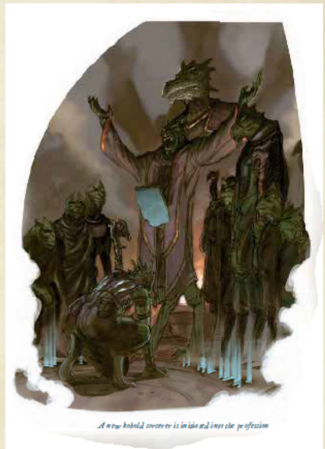
A new kobold sorcerer is initiated into the profession

No kobold can benefit from this rite more than once.